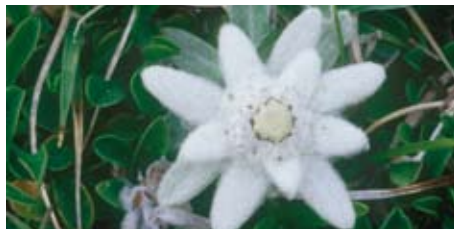
Edelweiss.

Scientific contributions relating to the scope and aim of the Workshop will be welcome and considered for poster presentations. Abstracts should be submitted to the EUFEPS Secretariat, both as an email attachment and as a hard copy. For editorial instructions, please visit the Workshop Website EUFEPS Online at: www.eufeps.org . Abstract submission deadline will be July 31, 2008.