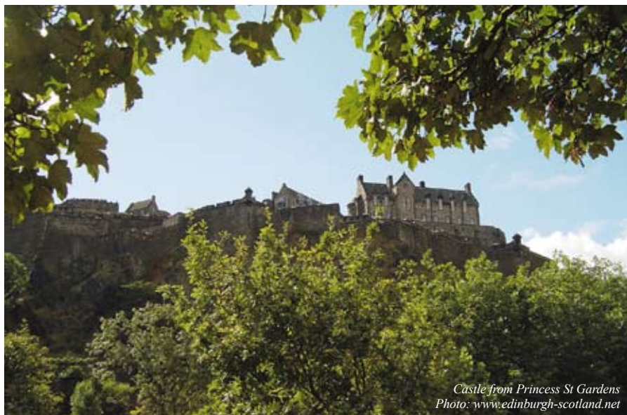
Castle from Princess St Gardens

October 1-3 • 2012 • Edinburgh • Scotland • United Kingdom