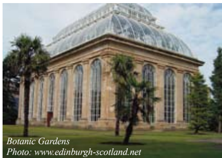
Botanic Gardens

academic and industrial scientists. The intent will be to assemble cutting edge knowledge to consider and debate contemporary challenges in drug usage, including the treatment of patients at the extremes of age and the impact of the disease process on effective and safe delivery of active pharmaceutical compounds.